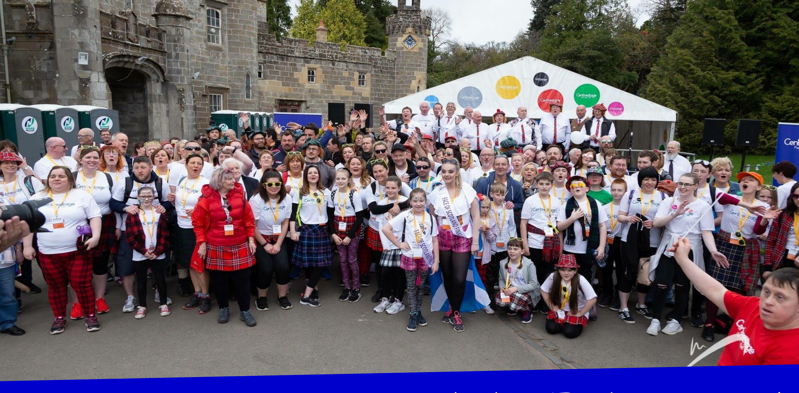
Bringing People Together!