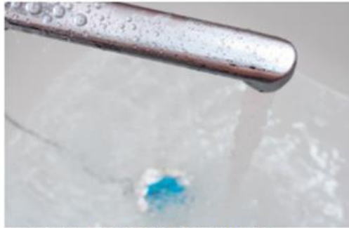
Tap water [illustrative].